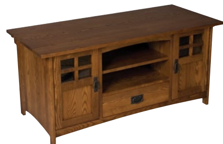
53-68 Entertainment Base Unit 50" W x 23" H x 21" D