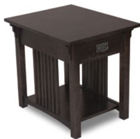
53-32 Lamp Table - 1 drawer, 1 shelf 22" W x 25" H x 27" D

FROM START TO FINISH, WE ARE FOCUSED ON DELIVERING QUALITY SOLID WOOD FURNITURE.