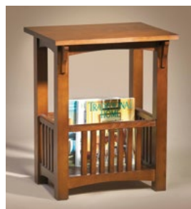
53-14 Magazine Table 16" W x 25" H x 20" D