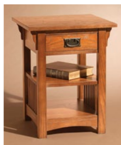
53-8 End Table - 1 drawer, 2 shelves 20" W x 25" H x 20" D