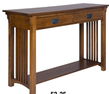
53-35 Sofa Table - 2 drawers 48" W x 30" H x 16" D