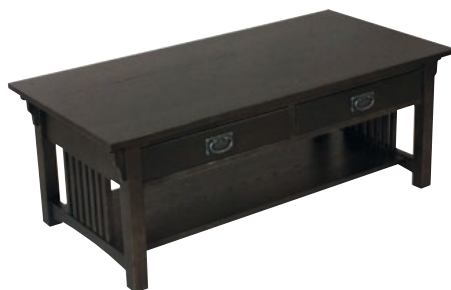
53-4 (cover image) Cocktail Table - 4 Drawers 48" W x 18" H x 34" D