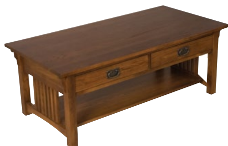
53-31 Cocktail Table - 2 drawers, 1 shelf 48" W x 18" H x 24" D